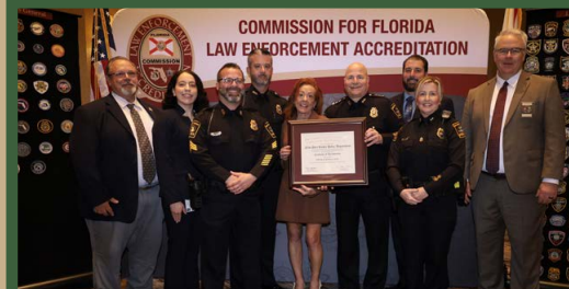
New Port Richey Police Department receiving their initial accreditation.