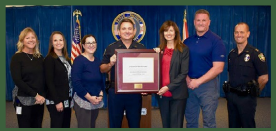
JACKSONVILLE SHERIFF'S OFFICE RECEIVED ITS THIRD EXCELSIOR STATUS AWARD.