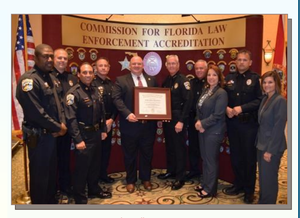
Naples Police Department