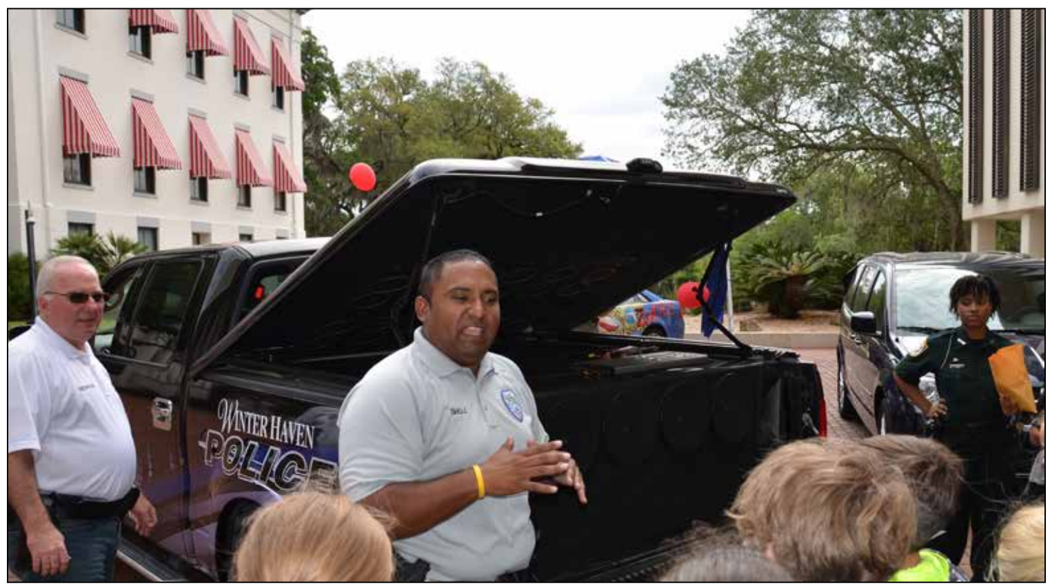
D.A.R.E. Officers speak to school children about making good choices as one part of fighting drug abuse.

National D.A.R.E. Day is observed each year on the third Thursday of April. This is an occasion for all to celebrate the contributions and accomplishments of the Drug Abuse Resistance Education (D.A.R.E.) curriculums and program, as well as honor the students who graduated from the program,