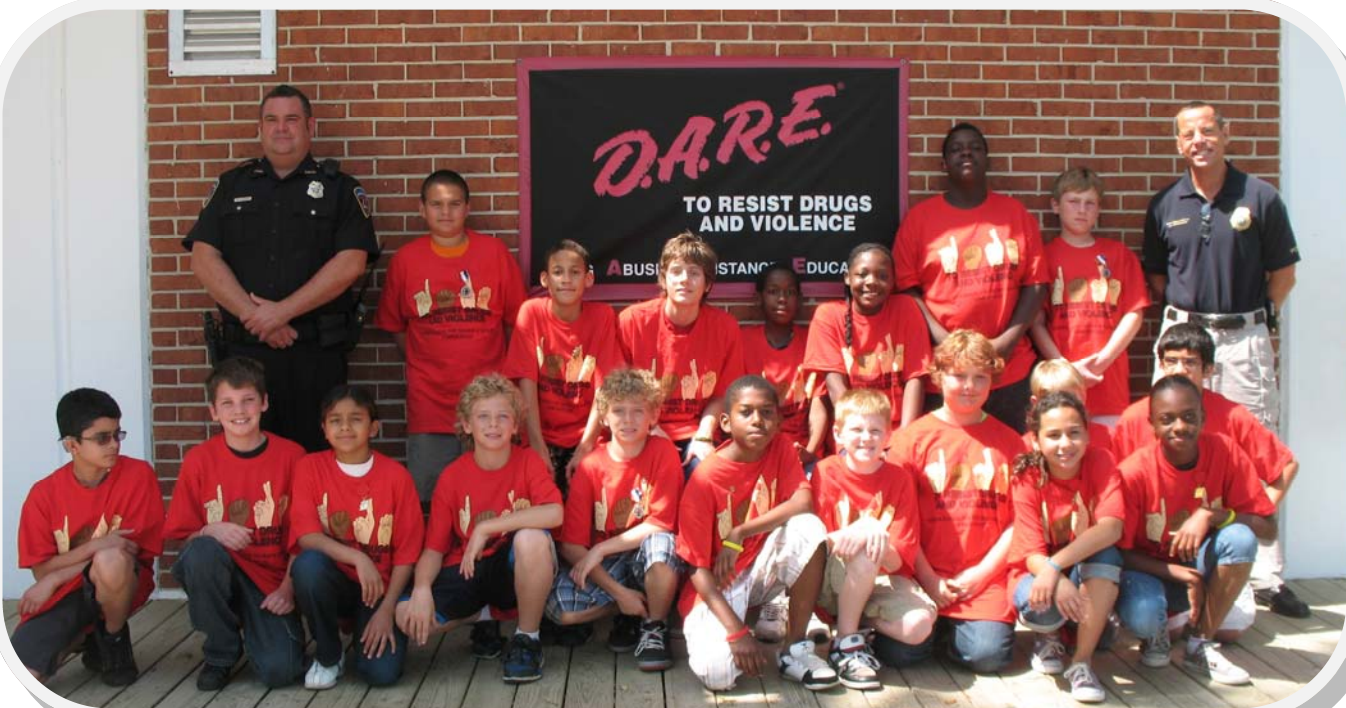
DARE Graduation at the Florida School For Deaf and Blind in St. Augustine.