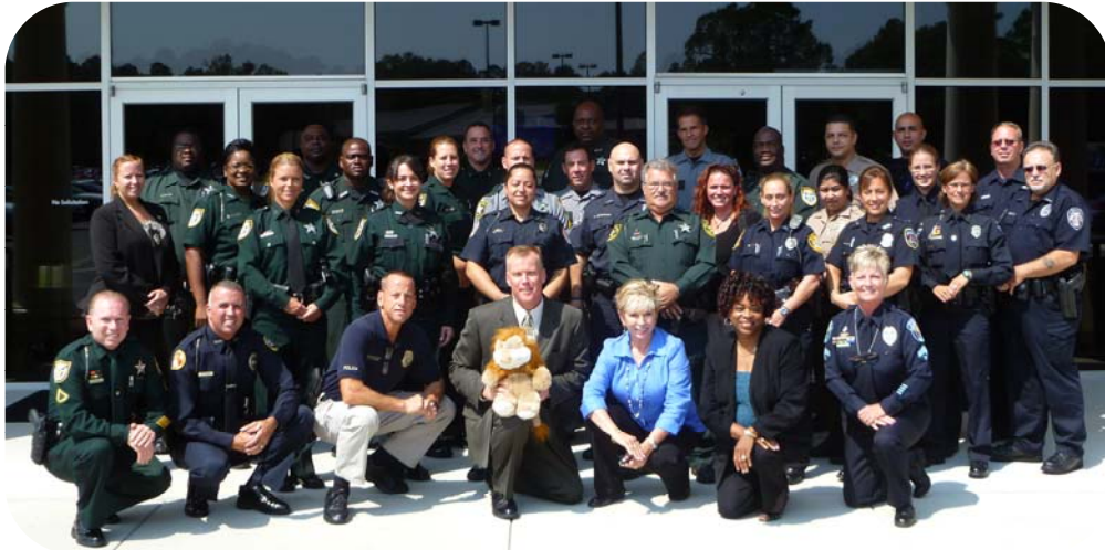
The August 22 - September 2, 2011 D.A.R.E. Officer Training class at the Florida Public Safety Institute in Havana, Florida.

Along with assisting Florida's law enforcement agencies with their D.A.R.E. units and their training, the Training Center maintains their relevancy by teaching full-time D.A.R.E. classes at various at-risk schools throughout Florida. The Florida D.A.R.E. Training Center works closely with D.A.R.E. America to insure that all instructor/mentors are trained and certified in the latest programs and curriculum.