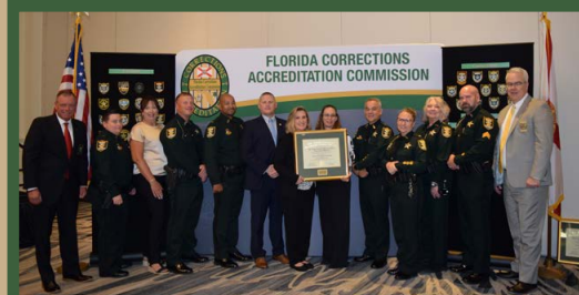
St. Johns County Sheriff's Office Corrections Division receives their third Excelsior reaccreditation.