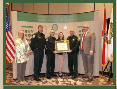
Hardee County Sheriff's Office Detention Division receives accreditation.

The Commission for Florida Law Enforcement Accreditation Inc. (CFA) and the Florida Corrections Accreditation Commission, Inc. (FCAC) held their meetings February 22-23, 2023. Nine agencies were reaccredited by the Commissions with Excelsior status. Excelsior status is awarded after five successful reaccreditations without conditions.