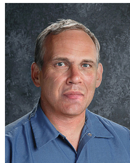
Age Progression Photo