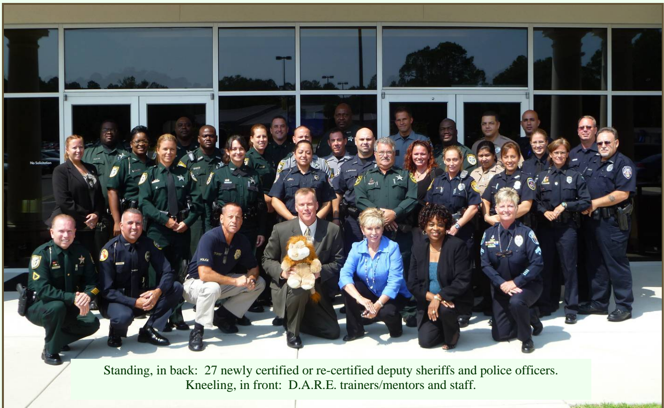
Standing, in back: 27 newly certified or re-certified deputy sheriffs and police officers. Kneeling, in front: D.A.R.E. trainers/mentors and staff.