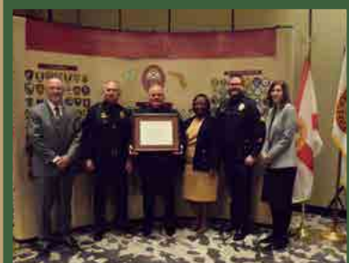
Lynn Haven Police Department Receives Initial Accreditation