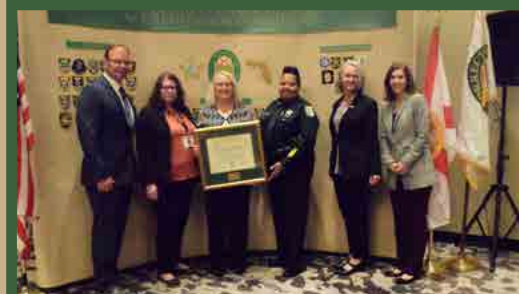
Seminole County Sheriff's Office John E. Polk Correctional Facility Receives Second Excelsior Award