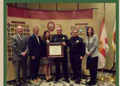
Surfside Police Department Receives Reaccreditation Award

The Commission for Florida Law Enforcement Accreditation, Inc. (CFA) and the Florida Corrections Accreditation Commission, Inc. (FCAC) held their meetings February 23-24, 2022. Eleven agencies were reaccredited by the Commissions with Excelsior status. Excelsior status is awarded after five successful reaccreditations without conditions.