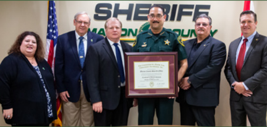
MARION COUNTY SHERIFF'S OFFICE RECEIVED ITS REACCREDITATION AWARD.