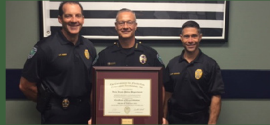
VERO BEACH POLICE DEPARTMENT RECEIVED ITS FIRST EXCELSIOR AWARD.

The Commission for Florida Law Enforcement Accreditation, Inc. (CFA) and the Florida Corrections Accreditation Commission, Inc. (FCAC) held their meetings February 17-18, 2021. Twelve agencies were reaccredited by the Commissions with Excelsior status. Excelsior status is awarded after five successful reaccreditations without conditions.