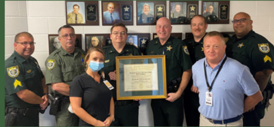
BREVARD COUNTY SHERIFF'S OFFICE JAIL COMPLEX RECEIVED ITS REACCREDITATION AWARD.