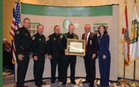
LAKE COUNTY SHERIFF'S OFFICE DETENTION CENTER RECEIVES REACCREDITATION AWARD