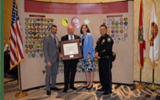
GULFPORT POLICE DEPARTMENT RECEIVES THIRD EXCELSIOR AWARD

The Commission for Florida Law Enforcement Accreditation, Inc. (CFA) and The Florida Corrections Accreditation Commission, Inc. (FCAC) held their meetings June 23-24, 2021. Six agencies were reaccredited by the Commissions with Excelsior status. Excelsior status is awarded after five successful reaccreditations without conditions.