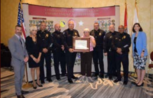
GROVELAND POLICE DEPARTMENT RECEIVES INITIAL ACCREDITATION AWARD