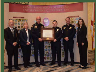
Key West Police Department Receives 1st Excelsior Award