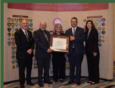
City of Tallahassee, Office of Inspector General Receives Initial Accreditation Award