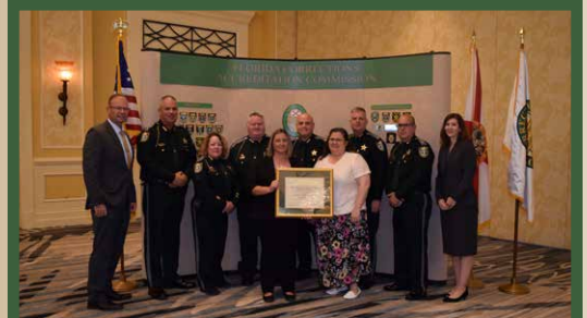
Hernando County Sheriff's Office Detention Center Receives Reaccreditation Award

The Commission for Florida Law Enforcement Accreditation, Inc. (CFA) and the Florida Corrections Accreditation Commission, Inc. (FCAC) held their meetings June 15-16, 2022. Fourteen agencies were reaccredited by the Commissions with Excelsior status. Excelsior status is awarded after five successful reaccreditations without conditions.