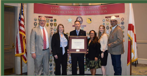
Department of Children and Families-Office of the Inspector General becomes one of the first two inspector general offices to receive Excelsior reaccrdition.