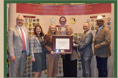
Department of Environmental Protection-Office of the Inspector General becomes one of the first two inspector general offices to receive Excelsior reaccrdition.

The Florida Corrections Accreditation Commission, Inc. (FCAC) and the Commission for Florida Law Enforcement Accreditation, Inc. (CFA) held their meetings, October 2-3, 2024. The FCAC reaccrditioned six agencies with Excelsior reaccrdition, a status that is awarded after five successful reaccrditions without conditions. Two agencies received their initial accreditation from the CFA, twelve were reaccrditioned with Excelsior status, and fifteen received reaccrdition.