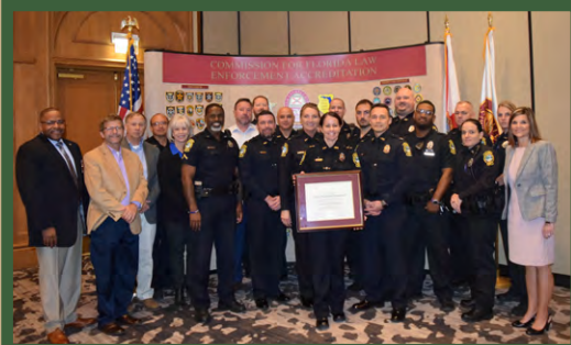
Atlantic Beach Police Department received Initial Accreditation.