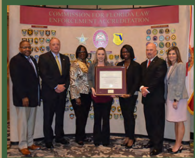
Florida Department of Law Enforcement received their third Excelsior Award.