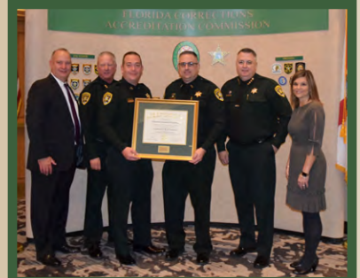
Escambia County Corrections received Excelsior Award.

The Florida Corrections Accreditation Commission, Inc. (FCAC) and The Commission for Florida Law Enforcement Accreditation, Inc. (CFA) held their meetings February 18 – 20, 2019. Twelve agencies reaccredited by the Commissions earned their Excelsior status. Excelsior status is awarded after five successful reaccreditations without conditions.