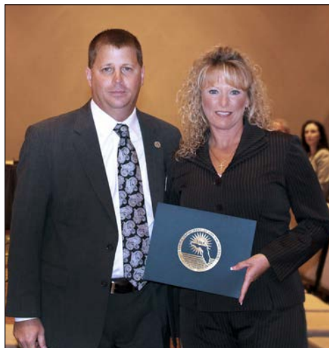
Polk State College, Kenneth C. Thompson Institute of Public Safety.