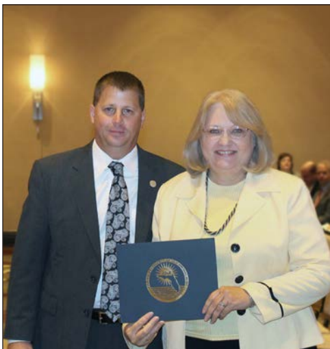
Criminal Justice Academy of Osceola