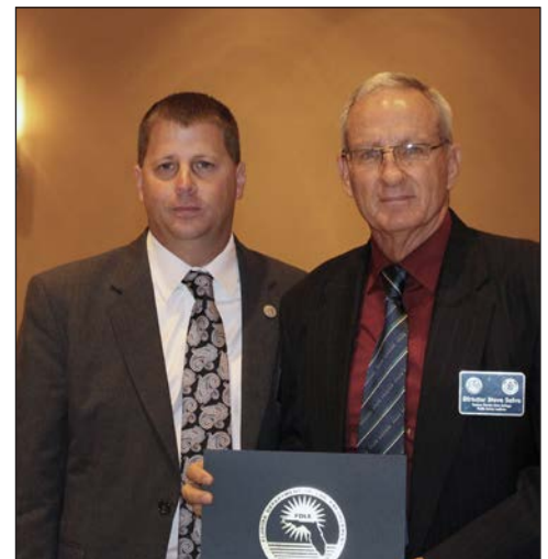
Eastern Florida State College, Public Safety Institute