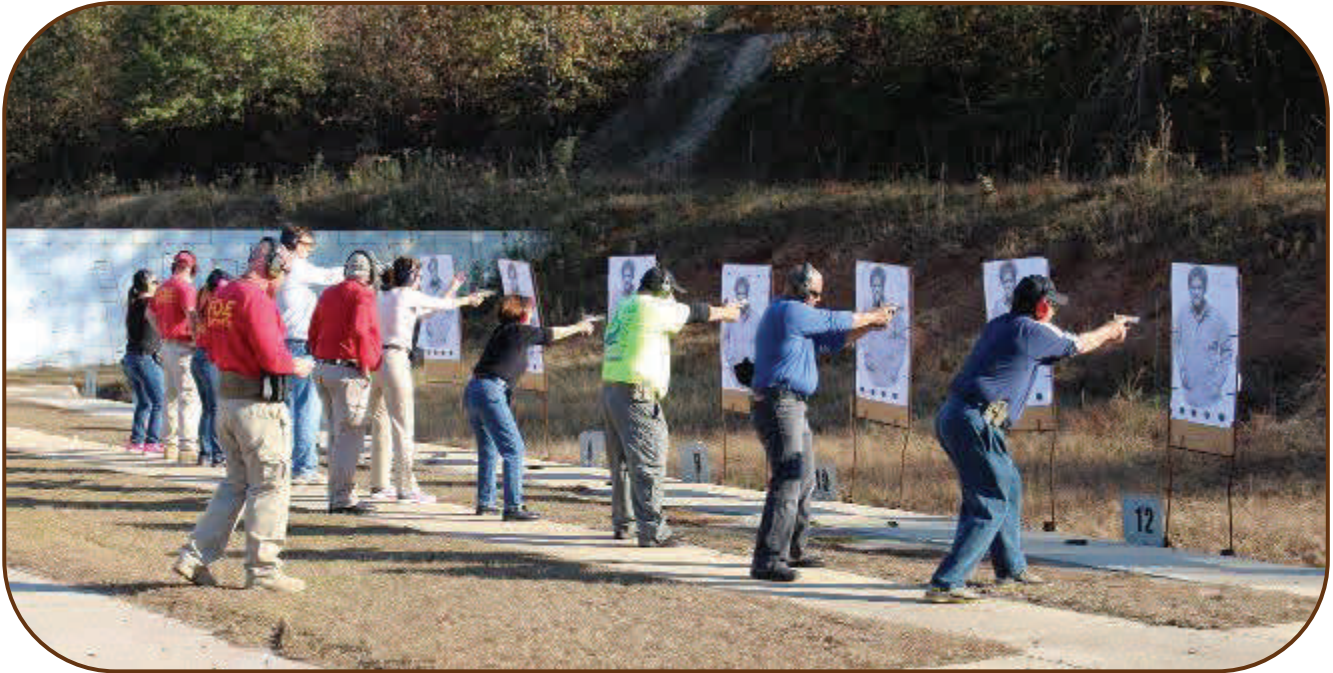
The proper techniques in controlling and shooting their firearm was an integral part of the new specialized course.