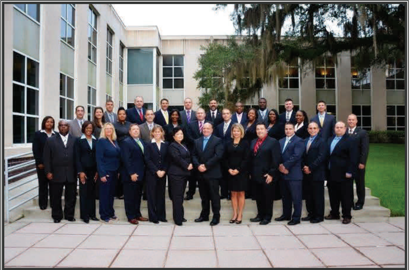
Senior Leadership Program, Class 17 Tallahassee, Florida

The goal of the Senior Leadership Program is to prepare Florida's criminal justice leadership for the challenging and changing demands of the future. Class participants study the trends and events that will challenge criminal justice professionals and the State in the new millennium and examine the leadership skills necessary to create and lead the changes that lie ahead.