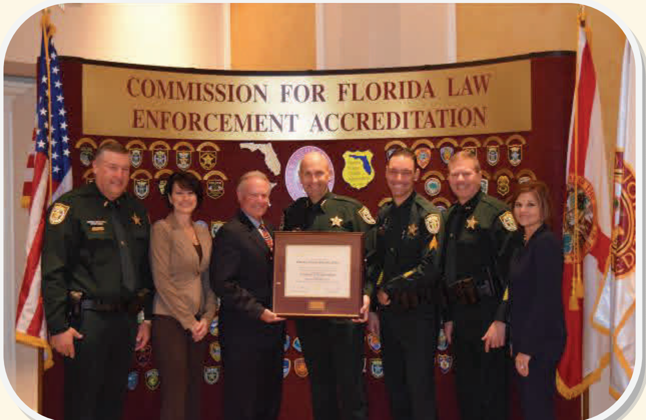
Osceola County Sheriff's Office — An Excelsior Agency

Daytona Beach Police Department Department of Health, Office of the Inspector General Escambia County Sheriff's Office Fernandina Beach Police Department Florida State University Police Department Lake Mary Police Department Lantana Police Department Longwood Police Department Ponce Inlet Police Department Sebastian Police Department Stuart Police Department University of North Florida Police Department Vero Beach Police Department Wakulla County Sheriff's Office