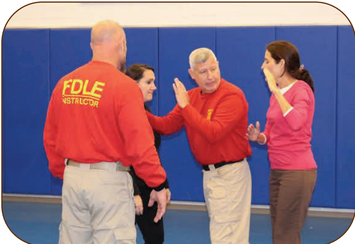
Defensive tactics quickly became the marshals' favorite topic. Students learned not only how to defend themselves, but also how to handle a disruptive person.