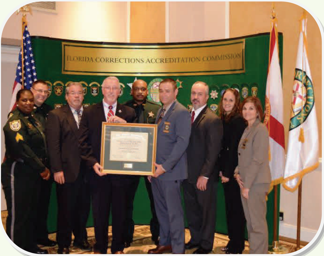
Alachua County Sheriff's Office

Alachua County Sheriff's Office Wakulla County Sheriff's Office