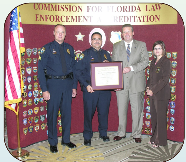
Palm Beach County School District Police

The Commission for Florida Law Enforcement Accreditation, Inc. (CFA) met on September 27, 2012, to review agencies for accredited status and conduct general business. The main order of business was to acknowledge the professionalism of agencies through granting accreditation. The Kissimmee Police Department and the Hendry County Sheriff's Office were awarded initial accreditation. Fifteen agencies were reaccredited by the Commission at this meeting: Putnam County Sheriff's Office, Department of Children and Families Office of the Inspector General, Department of Environmental Protection Office of the Inspector General, Monroe County Sheriff's Office, Palm Beach County Sheriff's Office, Palm Beach County School District Police, Surfside Police Department, Bradenton Police Department, Sanford Police Department, Satellite Beach Police Department, St. Petersburg Police Department, Venice Police Department, Winter Springs Police Department, and the University of South Florida Police Department. The Orlando Police Department was awarded reaccreditation by the Commission with recognition as an Excelsior Agency.