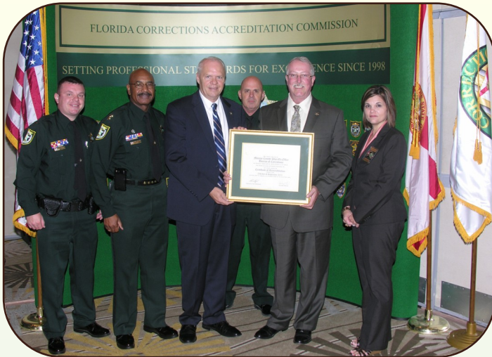
Monroe County Sheriff's Office

The Florida Accreditation conference was held September 24-28, 2012 at the Hyatt Regency Sarasota.