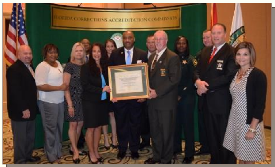
Broward County Sheriff’s Office Pretrial Services