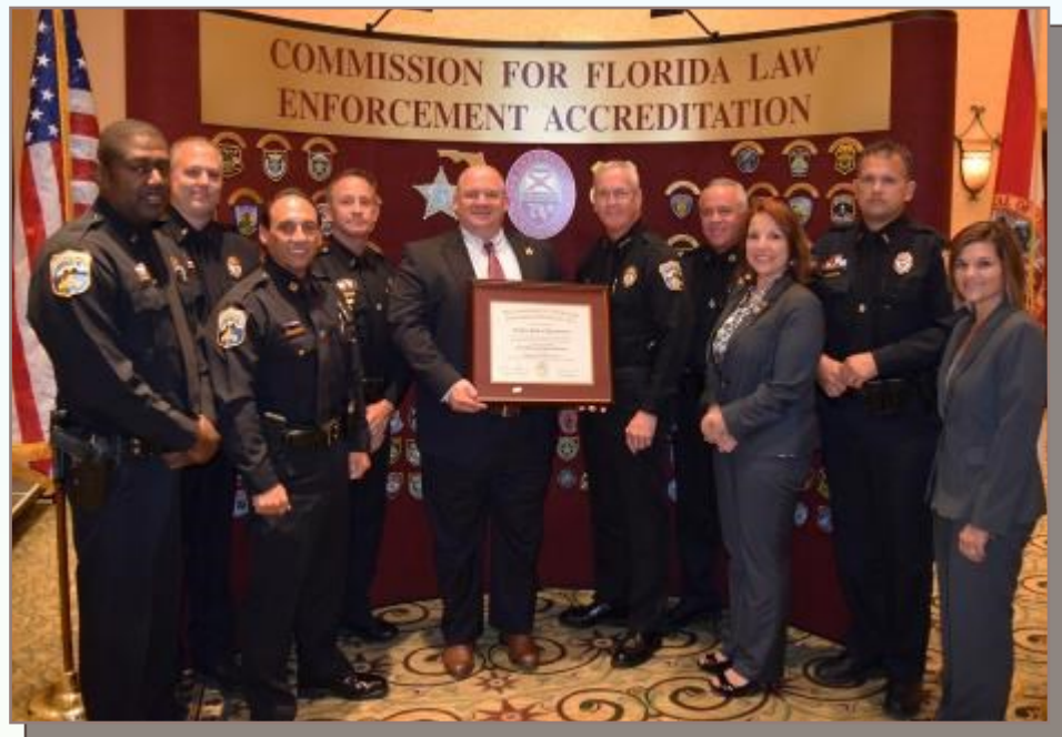
Naples Police Department