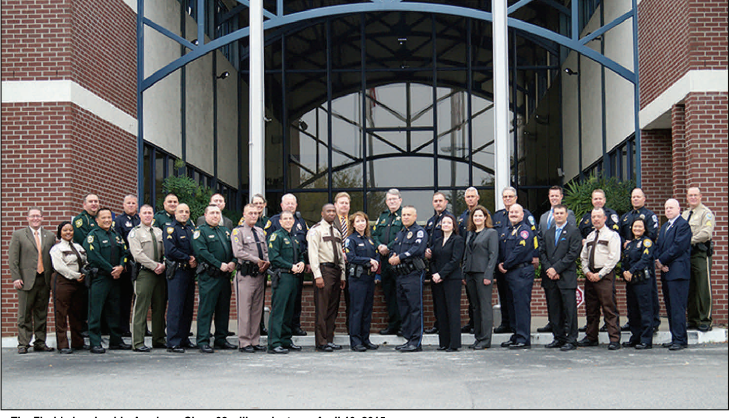
The Florida Leadership Academy Class 32 will graduate on April 10, 2015.

The Florida Criminal Justice Executive Institute announces the upcoming graduation of 32 first-line supervisors from the Florida Leadership Academy on April 10, 2015.