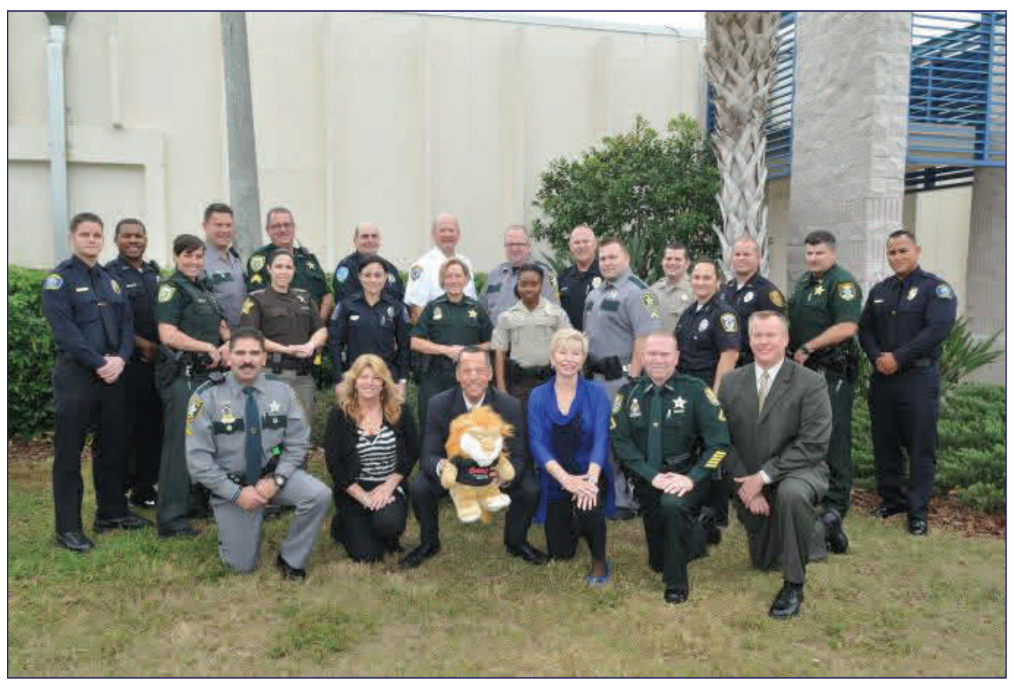
Standing: The 19 officers who were certified or recertified. Kneeling in front: The D.A.R.E. Training Program staff.