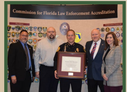
Tallahassee Police Department received their first Excelsior Award.

The Commission for Florida Law Enforcement Accreditation, Inc. (CFA) and The Florida Corrections Accreditation Commission, Inc. (FCAC) held their meetings February 19-20, 2020. Six agencies reaccredited by the Commissions earned their Excelsior status. Excelsior status is awarded after five successful reaccreditations without conditions.