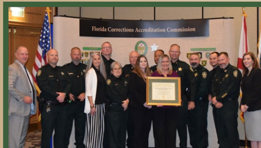
Highlands County Sheriff's Office Detention Bureau received reaccreditation.