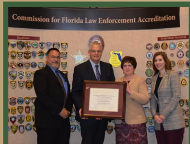
State University System Board of Governors, Office of Inspector General received Initial Accreditation.