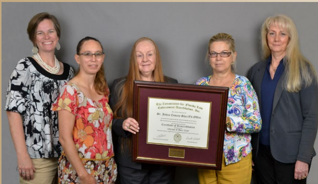
St. John's County Sheriff's Office received their fourth Excelsior Award.

The next Commission Meeting scheduled for October 14-15, 2020, will be held virtually via GoToMeeting. Ten FCAC agencies and 44 CFA agencies will be presented for review. Additional meeting information will be available at http://flaccreditation.org .