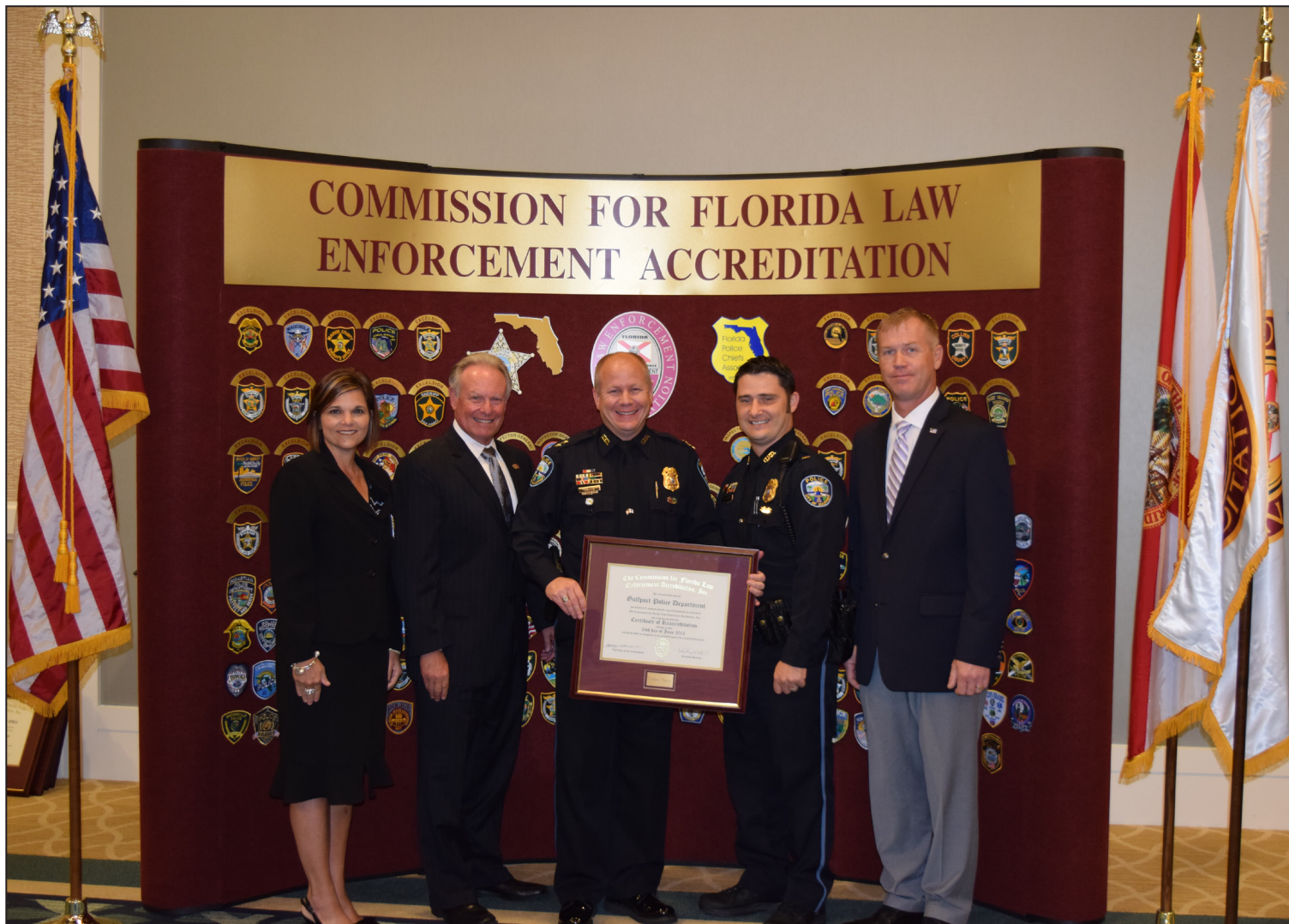
Gulfport Police Department was reaccredited with Excelsior status.