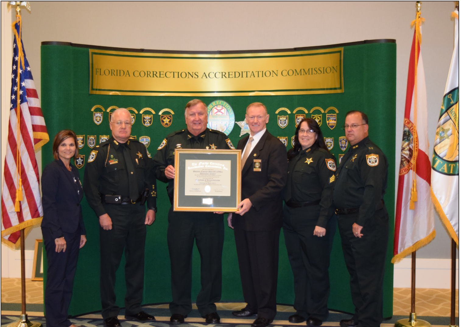
The Sumter County Sheriff's Office Detention Center was reaccredited with Excelsior status.