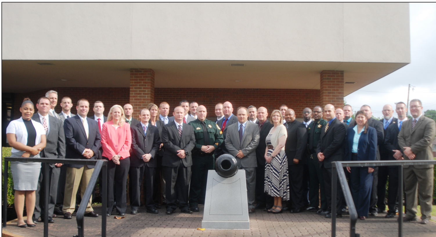
The most recent group of first-line supervisors to attend the Florida Leadership Academy.