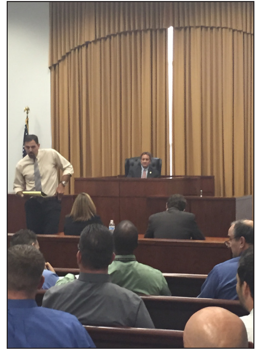
The Special Agent Training included scenarios and mock trials.

We congratulate the Special Agent Training Class graduates and welcome them to the FDLE family.