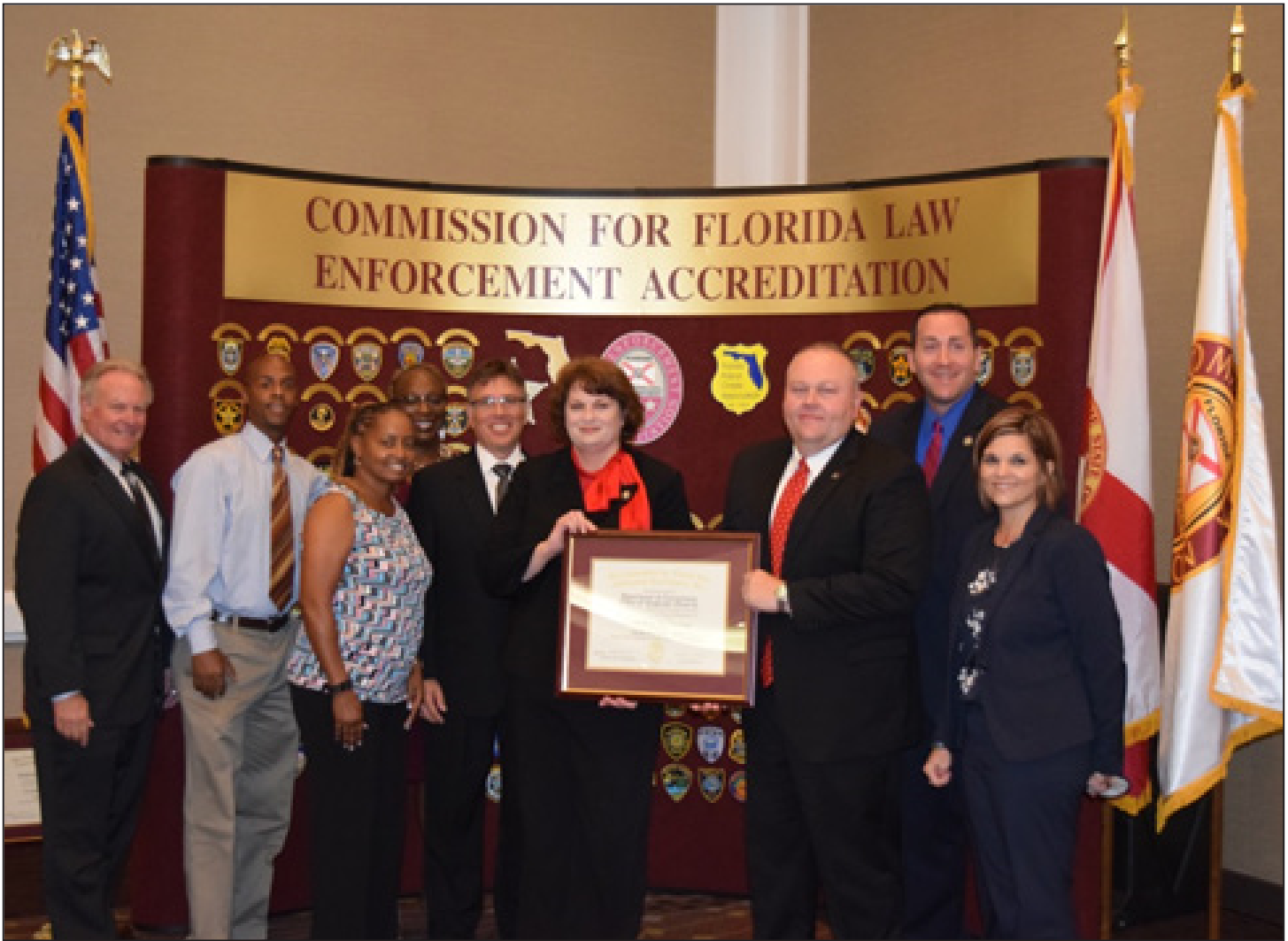
The Department of Corrections Office of Inspector General received initial accreditation.