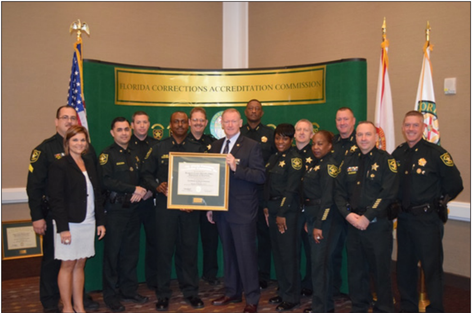
The Broward County Sheriff's Office Department of Detention was reaccredited with Excelsior status.