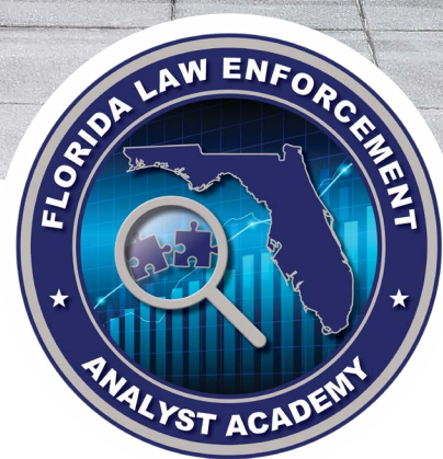
Florida Law Enforcement Analyst Academy Class 35