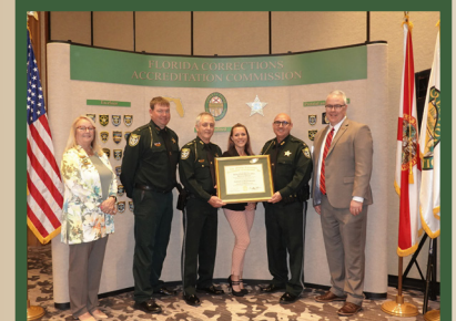
Hardee County Sheriff's Office Detention Division receives accreditation.

The Commission for Florida Law Enforcement Accreditation Inc. (CFA) and the Florida Corrections Accreditation Commission, Inc. (FCAC) held their meetings February 22-23, 2023. Nine agencies were reaccredited by the Commissions with Excelsior status. Excelsior status is awarded after five successful reaccreditations without conditions.